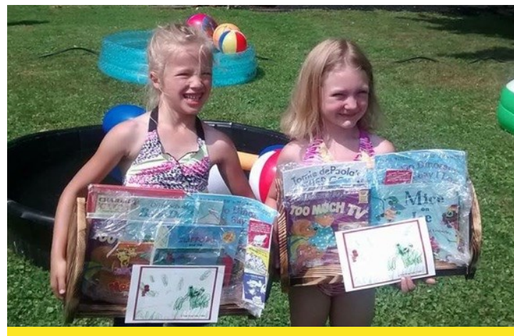
Tucker Valley Elementary/Middle School students display the books donated by Read Aloud and shelves made by students at the local WV Children's Home. Each kindergarten student at the school received a set.